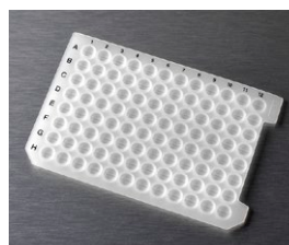
Axygen Axymat, silicone