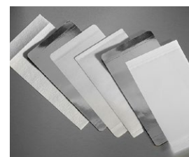
Axygen sealing films