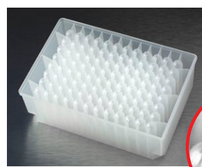
Rounded bottom and wall-to-wall technology